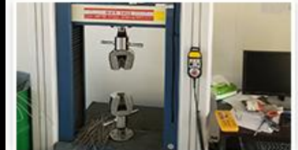
1 sets Wire Hardness Tester