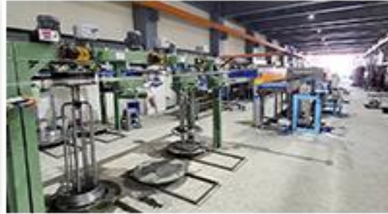
2 set Annealing Furnance