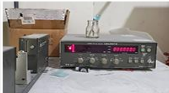
1 set Infrared tester