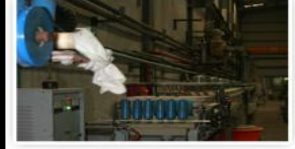
1 set Nickle Coating Equipment