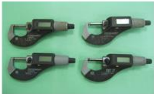
4 pcs Electrical Micrometer