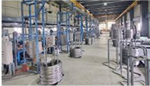
15 sets Wire Drawing Machine